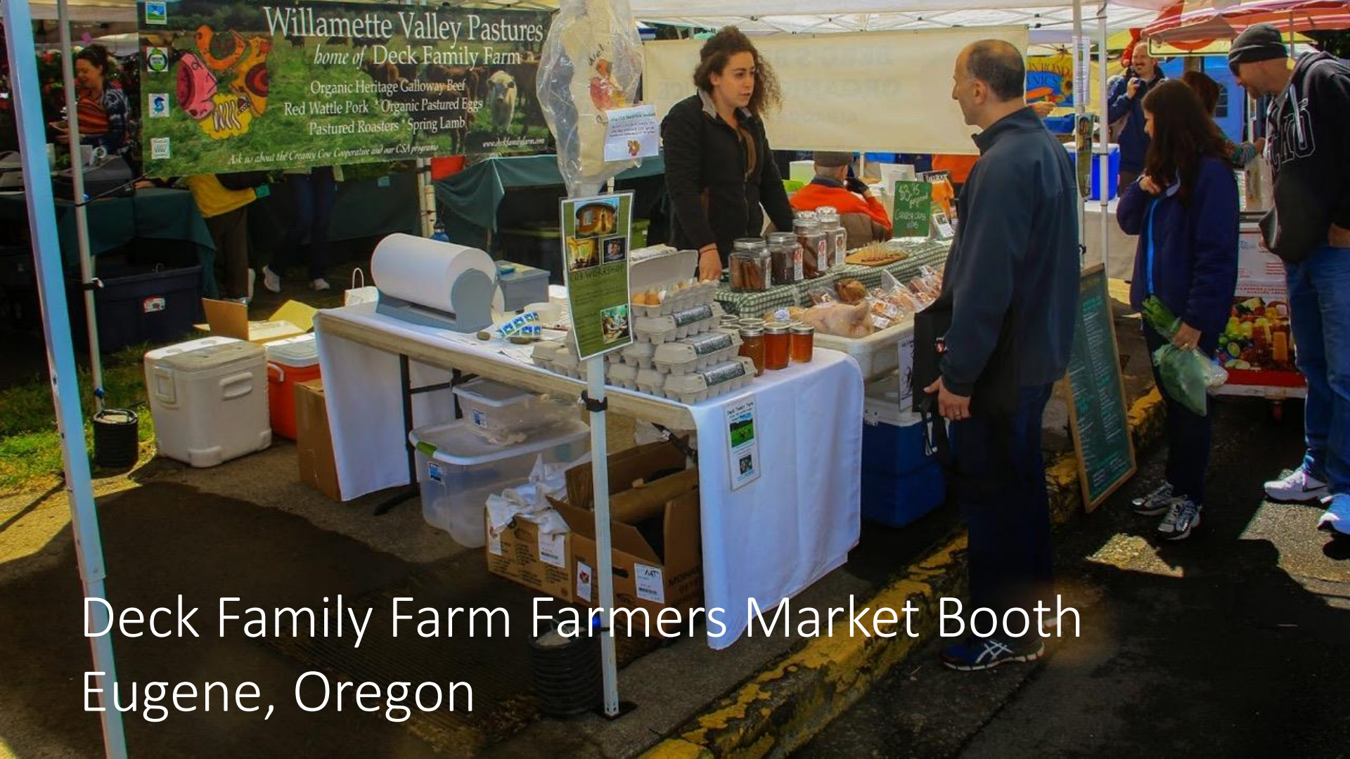
Deck Family Farm Farmers Market Booth Eugene, Oregon