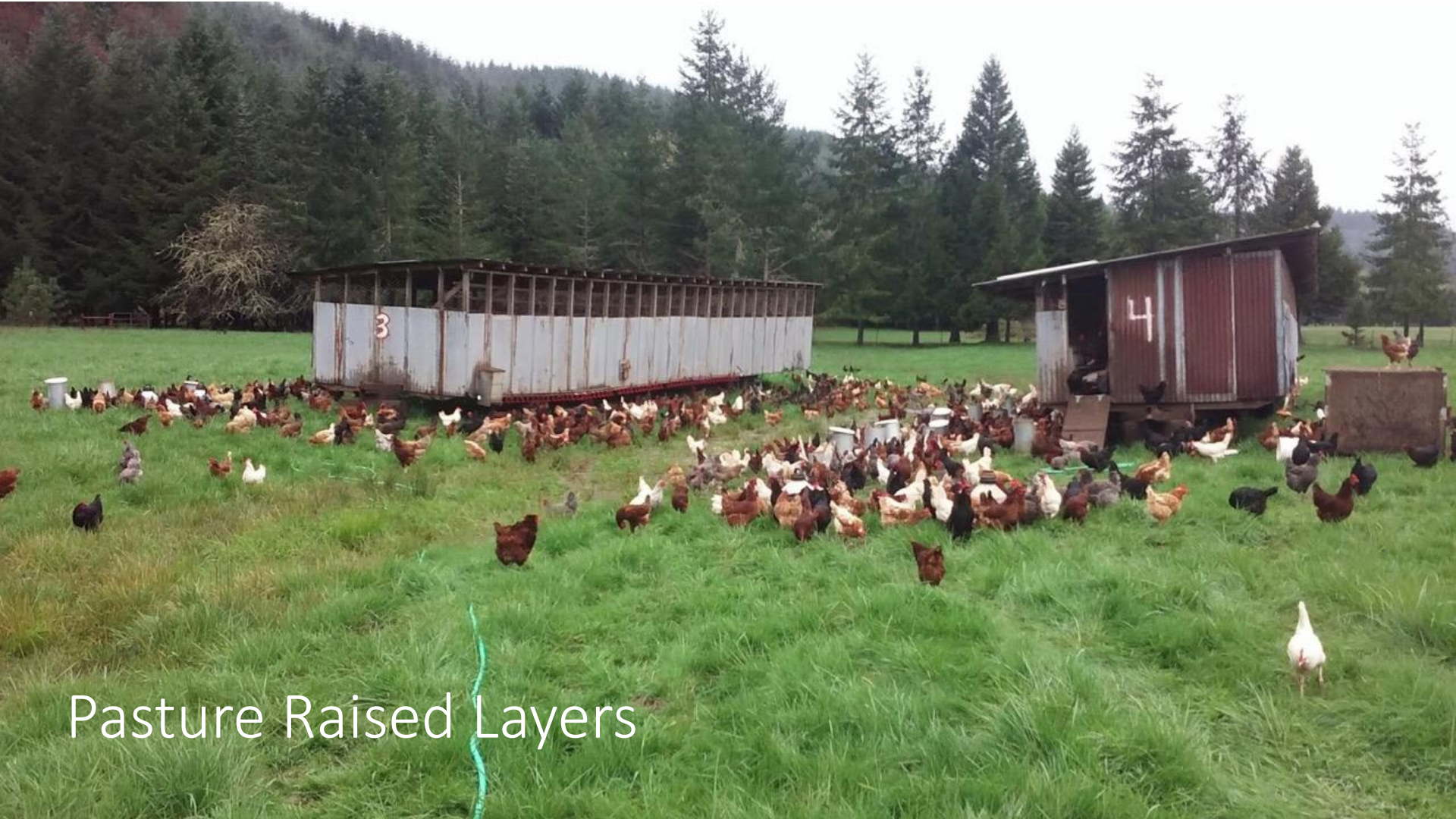
Pasture Raised Layers