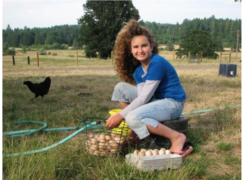
Collecting & washing eggs 2008