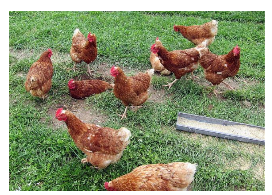
Browder's Birds Pastured Poultry Farm