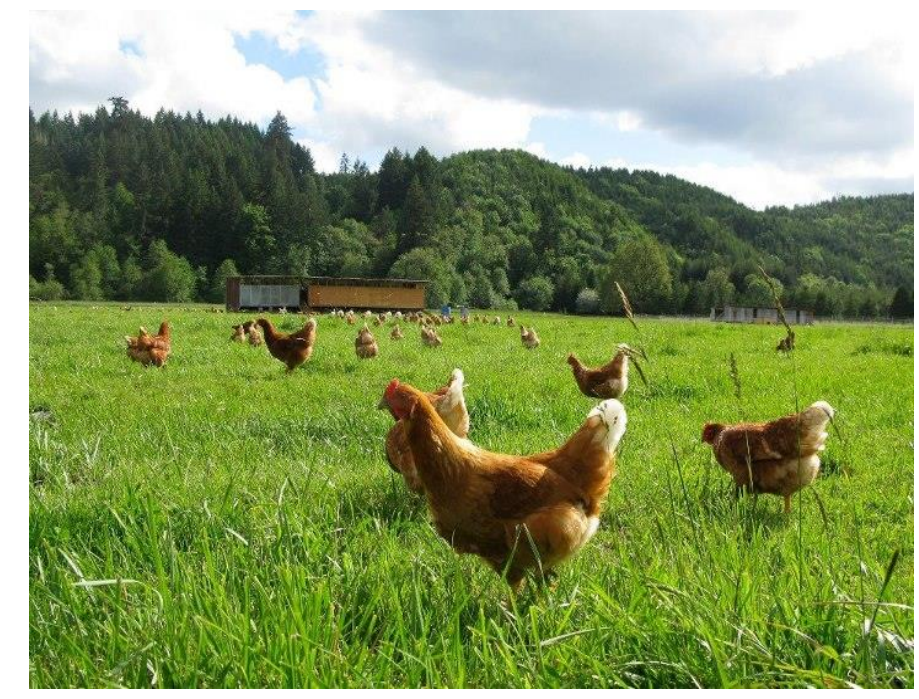
Deck Family Farm