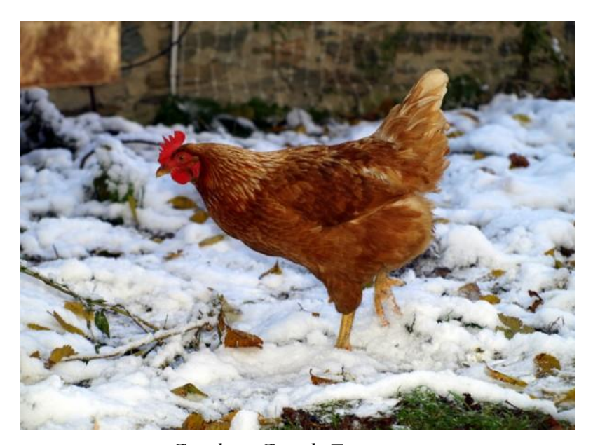
Cricket Creek Farm